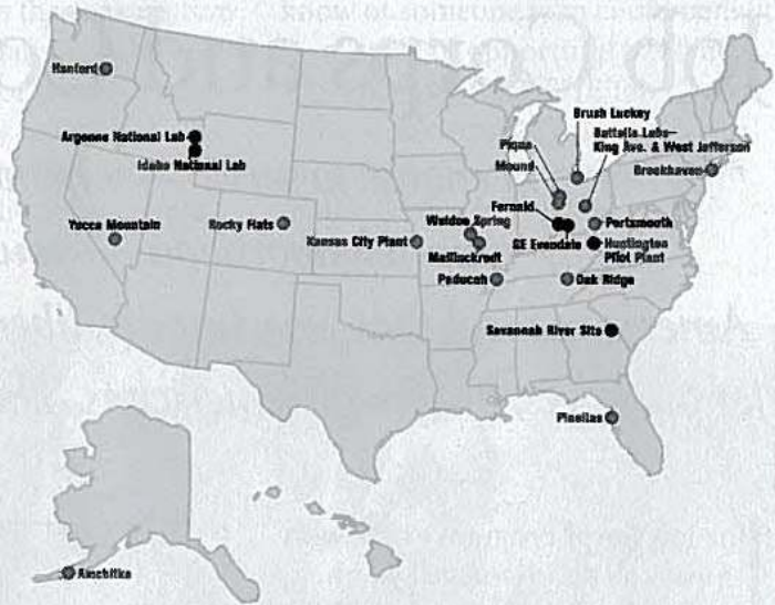
Building Trades Medical Screening Program locations.